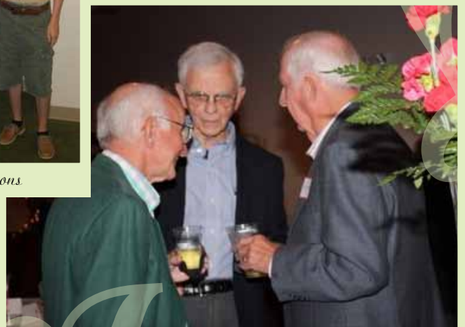
South Carolina Doctors' Day Event

If you would like your new officers listed and or photos from your state meetings, please send to the SMAA office at lodaniel@sma.org .