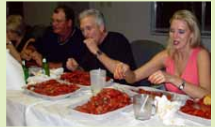
Grand Annual Crawfish - Seafood Boil

Besides getting reports together for our 3 categories of projects, things are busy here even in the summer. Please remember to submit your projects to the SMAA office by September 15, 2009.