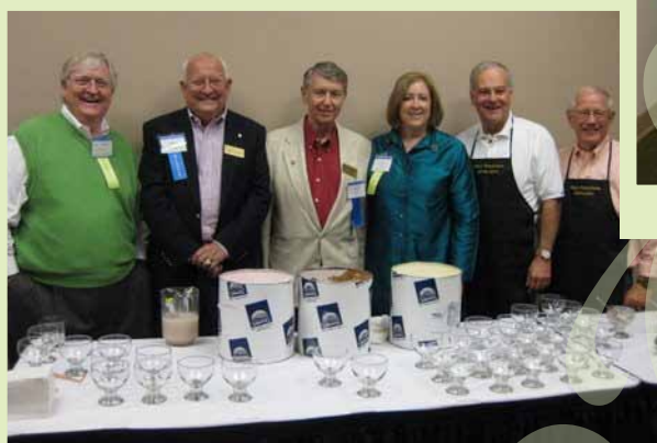
Mississippi Ice Cream Social